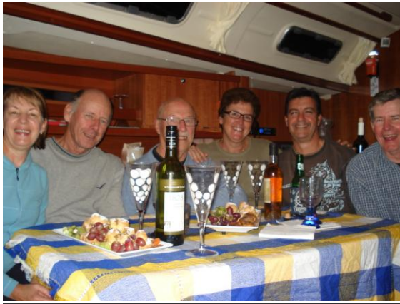
Dessert on Rendezvous

After a week of dastardly weather, the long weekend was shaping up to be fine if not a little cool. We were hopeful of a good turnout as 11 boats had committed to participating in the progressive dinner.