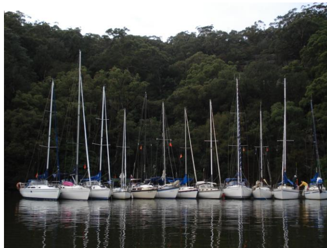
Castle Lagoon, 12 craft raft-up